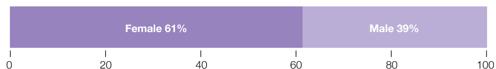
Figure: Percentage of women vs. men reporting cases of land and property violations 340

3.4.5 Out of all cases reviewed it was found that 48.2% of cases were reported because of disinheritance of properties.